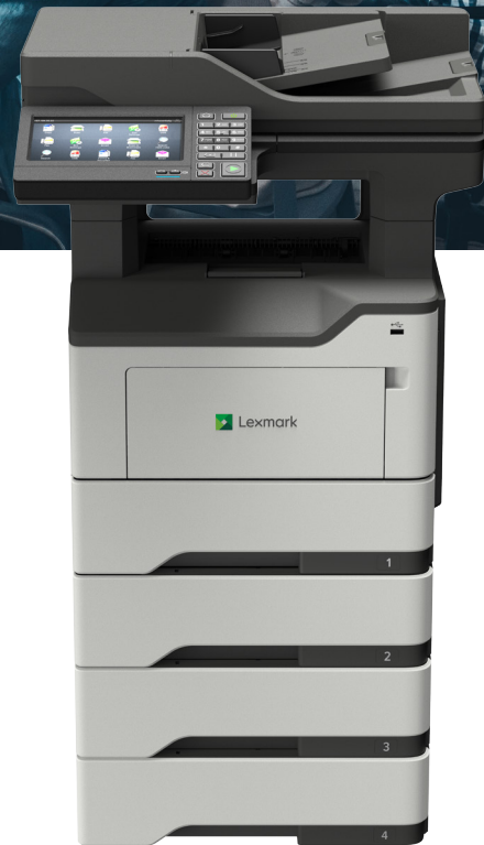
XM3250 with optional trays