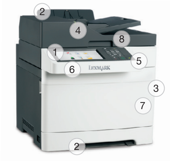
XC2132 with 7-inch colour touch screen