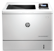
HP Color LaserJet Enterprise M553dh