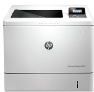
HP Color LaserJet Enterprise M553n

Speed and color are the perfect pair for your business. That's why this energy-efficient printer and Original HP Toner cartridges with JetIntelligence combine to produce vibrant, professional-quality documents right when employees need them.