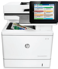
HP Color LaserJet Enterprise MFP M577dn

Ideal for enterprises and medium businesses that need a secure, highly productive, energy-efficient color MFP.