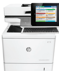
HP Color LaserJet Enterprise Flow MFP M577z