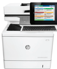
HP Color LaserJet Enterprise Flow MFP M577c